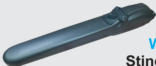
WING Sting Series