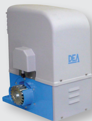
GULLIVER Heavy series 1500 / 2000 kg

Reliable at the time you need it the most