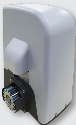
LIVI Lite series 400 / 900 kg